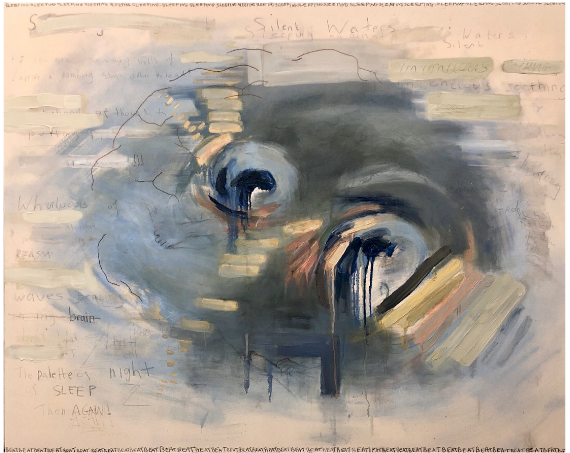
Lucy Ralph, Silent Waters , 72" x 56", 2019