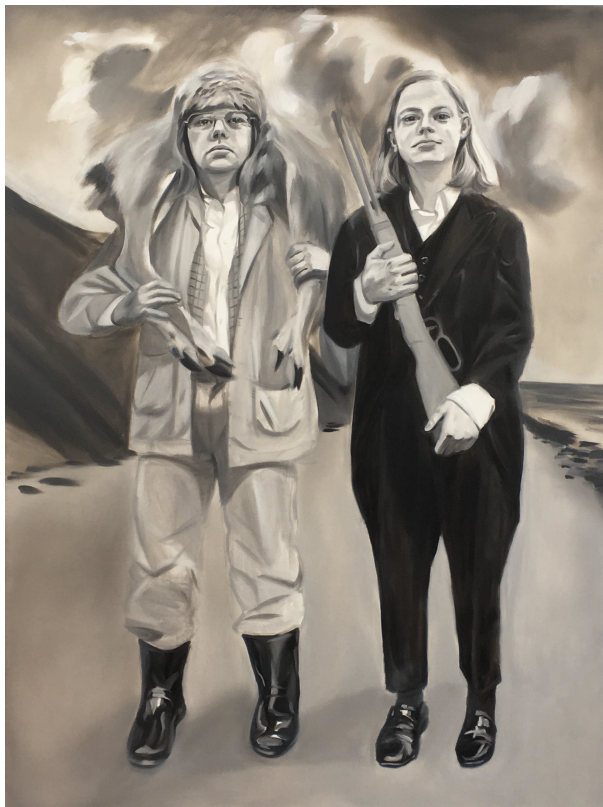
Cate Pasquarelli, Twins , 42" x 56", 2019